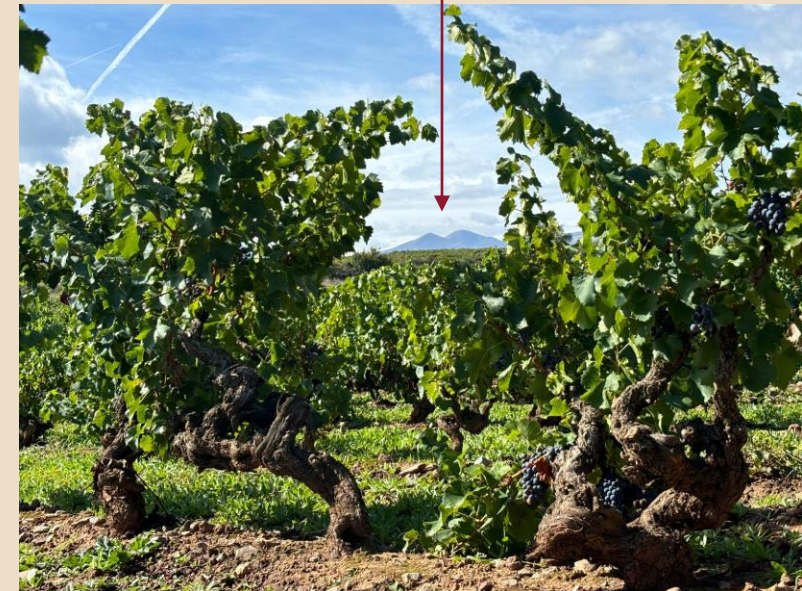
Cabezaparda 2106 m

Cabezaparda is the peak that rises next to San Lorenzo , the highest mountain in La Rioja. It's the place everyone asks about. The one that sparks curiosity. And the one you'll never forget.