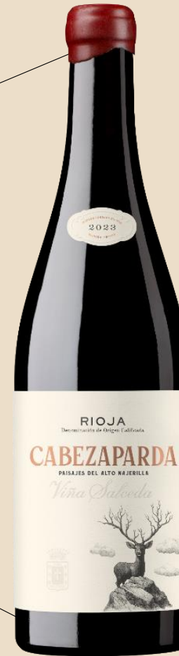
TINTO ALTO NAJERILLA