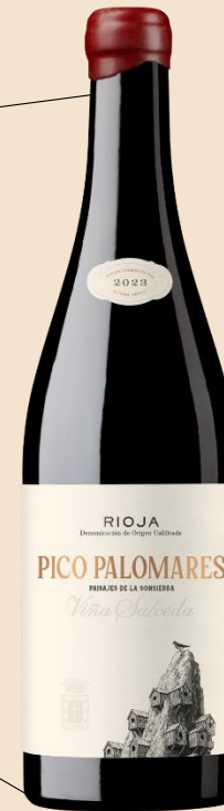
SONSIERRA RED WINE